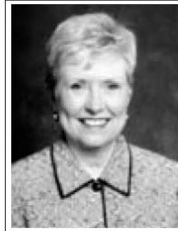
Mayor Kay Barnes

“One of my goals during my term is to enhance Kansas City’s international opportunities, visibility and reputation. One of the ways we can accomplish this goal is by promoting positive international relations and supporting the principles for which the United Nations stands.”